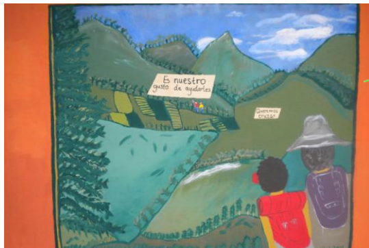
"It would be our pleasure to help."

Pam & guide indicate to 'people' on other side of canyon to indicate path to cross. These 'boys' go 1.5 hrs out of their way to help.