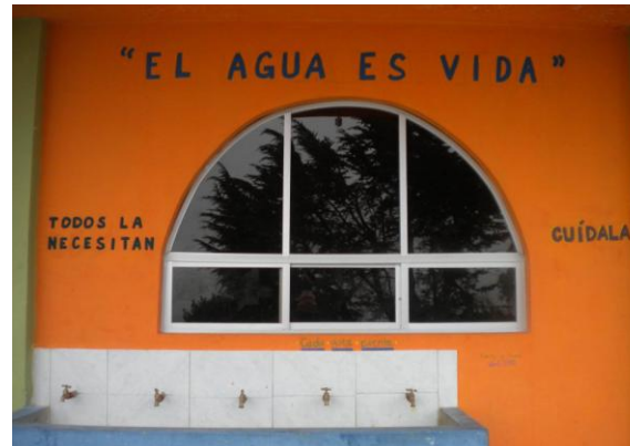
"Water is Life" Everyone Needs It. Save It. Every Drop Counts.

Nov '06: Engineers Without Borders-Denver started the design of Potable Water System