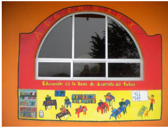
"Education is the key for the future."

Nov '06: Second story of "Escuela La Minga": Library, computer lab, kids studying at desks.