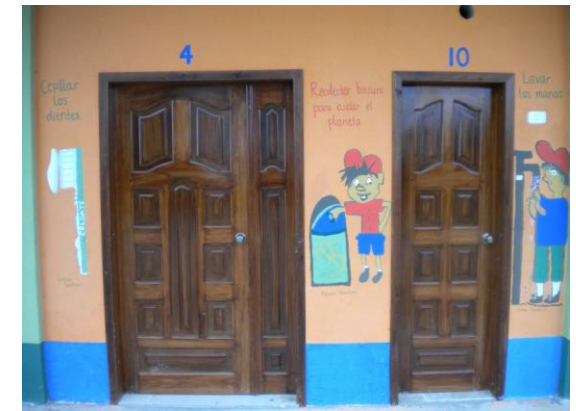
Brush your teeth - Put trash in bin - Wash hands

Hygiene and Good Habit Reminders by entrance to medical room and a shower