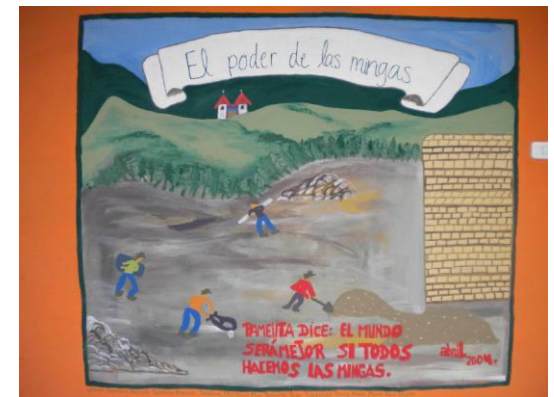
"The power of a minga".

Apr '04: First (of many) mingas (barn-raising) to build "Escuela La Minga" which was a large classroom, teacher's apt., and 1 st shower; inaugurated Sep '04.