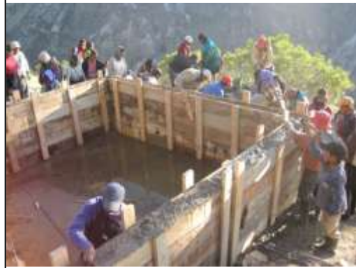
Below is this tank in use.