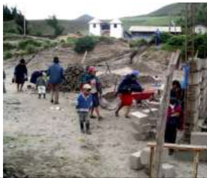
Minga is Quechua for 'barn raising'

Apr '04 Pam returns with $5,000 and the work begins in earnest on a large classroom plus an apartment including a shower . to be used for 2 teachers (who arrive from Latacunga, the county seat 2.5 hrs away).