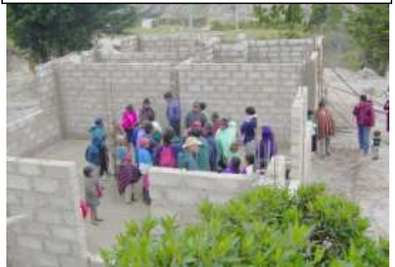
Front: classroom Back center: Shower Back left: 2 bedrooms Back right: kitchen/lv room

Sep '04 Inauguration of our Colegio (secondary school) with 31 students in '8 th grade'. The people were SO proud! Unfortunately our shower didn't work. The water pressure wasn't consistent for proper functioning of the flash heater and the shower occupant often got scalded.