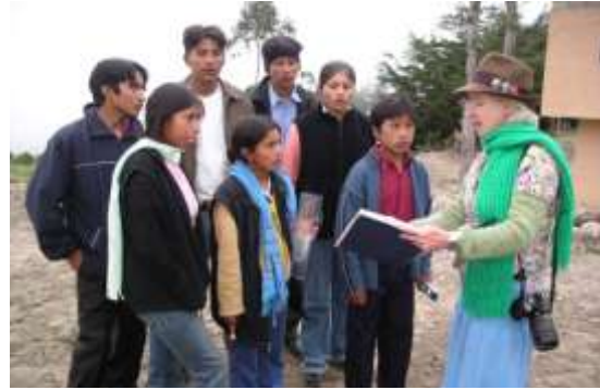
Teaching plumbing lessons. Training teenages in GPS & water gauge measurements.