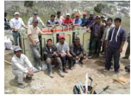
The Tunguicheans were jubilant about the quick and easy to use tank forms.