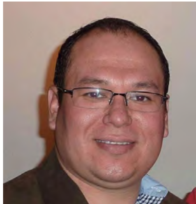
* Visit by Rotary Club of Latacunga